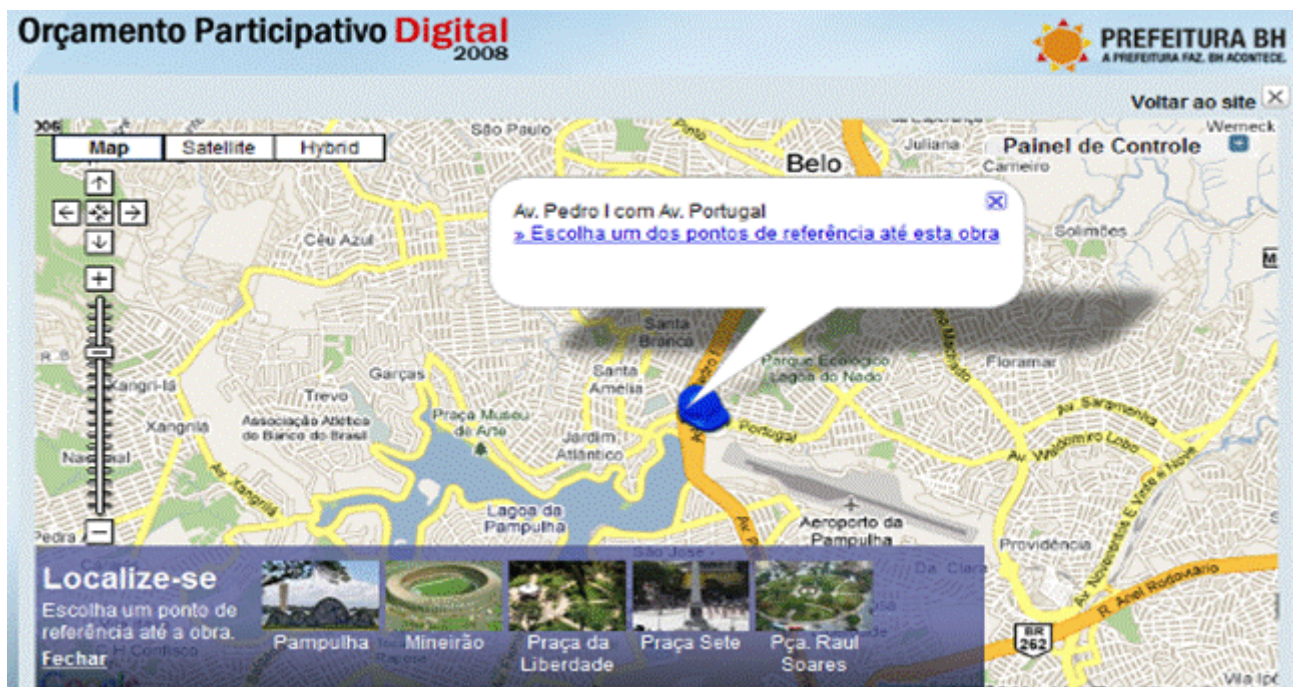
Figure 1: online map to locate the projects