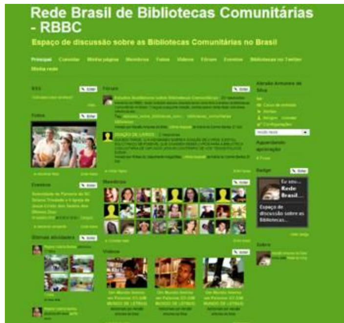
Figure 1: RBBC Homepage

Based on this realization, a group of participants in the seminar, made up of students of Librarianship and Information Science, as well as librarians, researchers in these fields and local leaders in charge of community libraries, decided to create a social network on the internet that would have the following aims: to bring together and share information regarding the practices employed in setting up and providing access to local collections, especially to members of disadvantaged groups; discuss and reflect upon the principles that govern the autonomous management of these spaces; establish ties and promote exchanges between the different agents and spheres involved in this process; and encourage society's participation in the construction of public policy for Brazilian libraries.