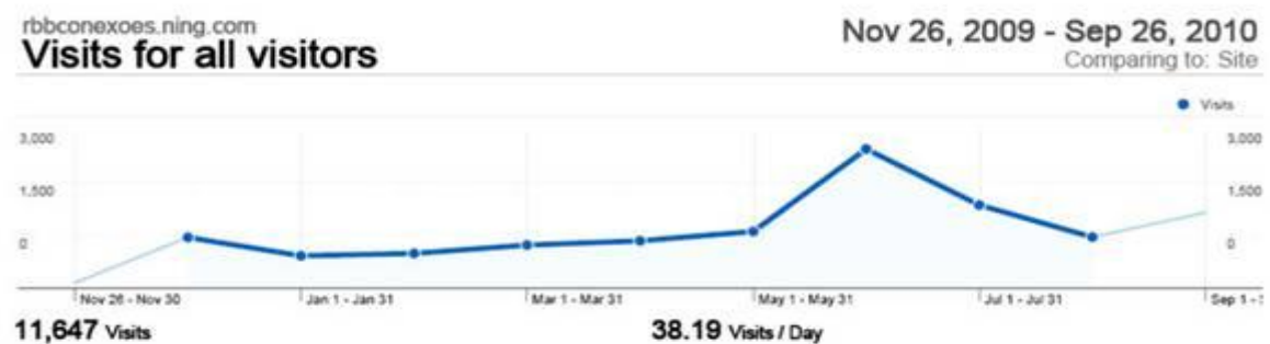
Graph 3: Visits by time periods

During the 10 months of RBBC activity that were analyzed, we observed continuous use of the network, with almost 40 daily visits. As shown in Graph 3, there was a higher access rate in 2010 and we hope the rising use of the RBBC constitutes a long term trend.