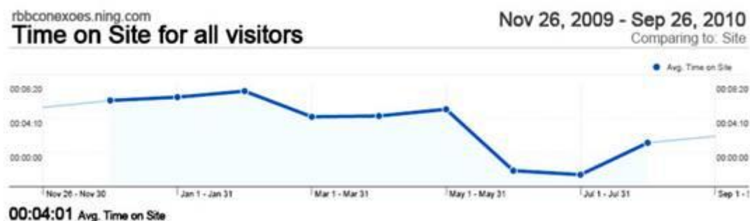
Graph 4: Average time per visit

The average time spent on the network was 4.01 minutes. A drop in this variable was observed in 2010, but it now appears to be rising to previously recorded levels. The trend can be seen in Graph 4.