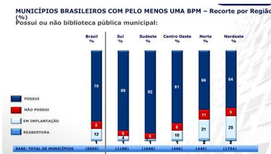
Graph 1: Brazilian municipalities with at least one public municipal library

Data from the 1 st Census of Public Municipal Libraries in 2010, created by the Ministério da Cultura and the Fundação Getúlio Vargas, clearly show that this is indeed the case: 8% of Brazilian municipalities in the present day do not have a single public library to provide for their inhabitants; another 12% are currently in the process of implementing such a service. Graph 1, below, shows the regional disparities that exist in regard to the presence of these public cultural spaces.