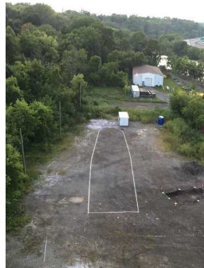
Figure 5. Shickluna Shipyard, 2019. Outline of the location of the buried James Norris schooner.

As part of the course curriculum, I gave a talk on the mapping project including the detailed process for locating the “dig” pits, or operational areas. I also led the students on a canal tour as an orientation for “placing” the shipyard in historic context. Throughout the summer the project’s progress was documented by social media, such as Twitter and Facebook. The University’s Brock News was especially instrumental in raising the profile of the project through news features. Later that summer we ran open-house weekends for the general public and local dignitaries to tour the Shipyard; view some of the artifacts; to learn the Louis Shickluna story and the impact his shipyard had on the local community, and sell t-shirts. Using GIS field techniques, we chalked the outline of the submerged ship. The event generated a frenzy of interest from the local community, the local media, and gained an extensive network of Friends of Shickluna , including a distant relative of Shickluna. We meet regularly at the historic Mansion House c1800 pub (once a store of Hamilton Merritt – the founder of the Welland Canal). More importantly this sparked numerous news articles, radio interviews and greater attention from local politicians and the business community – potential funders for the larger picture! https://www.facebook.com/shicklunashipyard/