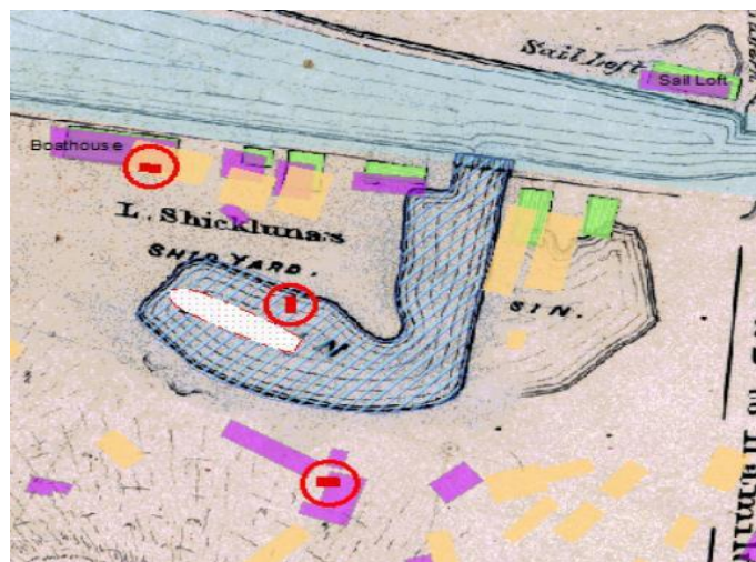
Figure 2. Shickluna Shipyard Mapping Project. Location of Operational Areas (dig sites).