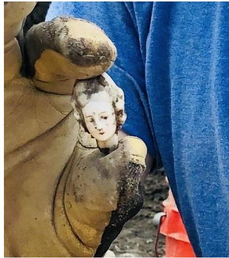
Figures 3 and 4. Samples of uncovered artifacts.

As part of the course curriculum, I gave a talk on the mapping project including the detailed process for locating the “dig” pits, or operational areas. I also led the students on a canal tour as an orientation for “placing” the shipyard in historic context. Throughout the summer the project’s progress was documented by social media, such as Twitter and Facebook. The University’s Brock News was especially instrumental in raising the profile of the project through news features. Later that summer we ran open-house weekends for the general public and local dignitaries to tour the Shipyard; view some of the artifacts; to learn the Louis Shickluna story and the impact his shipyard had on the local community, and sell t-shirts. Using GIS field techniques, we chalked the outline of the submerged ship. The event generated a frenzy of interest from the local community, the local media, and gained an extensive network of Friends of Shickluna , including a distant relative of Shickluna. We meet regularly at the historic Mansion House c1800 pub (once a store of Hamilton Merritt – the founder of the Welland Canal). More importantly this sparked numerous news articles, radio interviews and greater attention from local politicians and the business community – potential funders for the larger picture! https://www.facebook.com/shicklunashipyard/