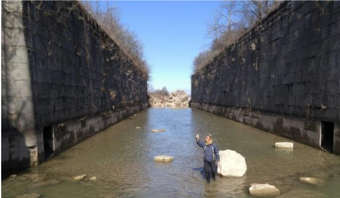
Figure 6. 360 filming in Lock 12 chamber, Third Welland Canal.

I became involved with this project during my last “working year” followed by a sabbatical. It was an early retirement incentive. It resulted in a very fluid transition rather than a “what do I do in retirement?” conundrum. As Emeritus status, my research continues with all the resource perks the university has to offer.