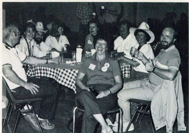
Saint John in 1987 will owe a lot to these people — the New Brunswick contingent, seen here enjoying the post barbecue festivities on Wednesday night.