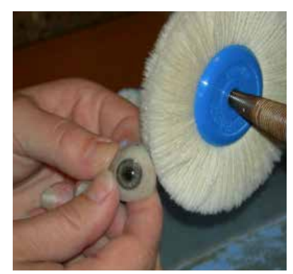
Figure 11. Polishing the prosthesis.

In addition to inspection of the prosthetic device, the patient should be questioned regarding care of the device. Because ocular prosthetics are custom made, care is custom as well. What may be standard for one patient could be completely different for another. The patient should limit the removal of the prosthesis. Removing the device too often can lead to increased mucous production and irritation of the orbital tissue. The device should be left in place and only removed for cleaning approximately once per month.<sup>22,23</sup> The recommendation for cleaning the prosthesis will be dependent upon the mucous and protein deposition. The prosthesis can be cleaned with soap and water, baby shampoo and water, or gas permeable contact lens cleaner.<sup>23,24</sup>