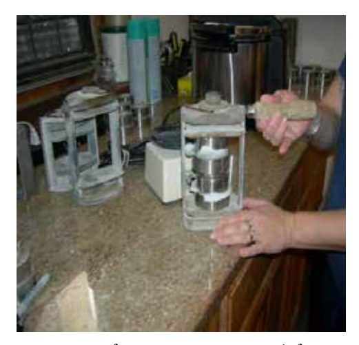
Figure 8. Use of Carver press to remove air from custom prosthesis prior to hardening.