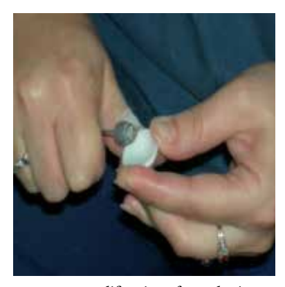
Figure 10 . Modification of prosthetic device .