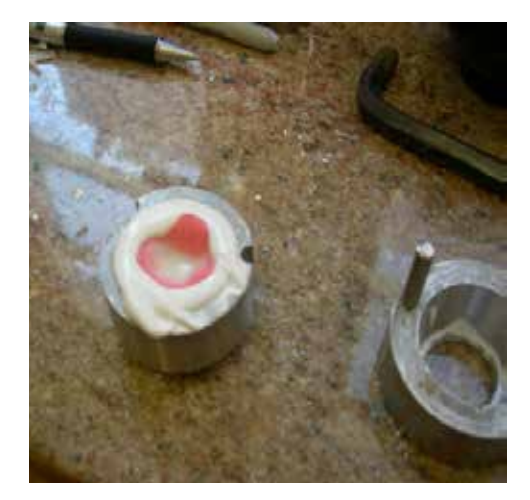
Figure 7. Cast used to make custom prosthesis.

To ensure a comfortable fit, inspection of the prosthesis is important. The device should be smooth and free of sharp edges. If the device does not feel smooth, it can be washed with soap and water or gas permeable contact lens solution. If it continues to feel rough, then the device likely requires polishing, contouring or replacement.<sup>23</sup> Polishing of the ocular prosthesis, unlike polishing of a gas permeable contact lens, cannot be done in office and requires a referral to the ocularist. Contouring to ensure proper fitting in the changing socket requires specialized equipment and also requires the ocularist's expertise.<sup>23</sup> (Figures 10, 11)