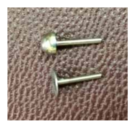
Figure 4. Peg

tissue and to serve as a scaffold for reattachment of the extraocular muscles, the hydroxyapatite implant is wrapped in materials ranging from donor sclera or autologous tissue to synthetic vicryl or polyglactin mesh.<sup>5,21</sup> Aluminum oxide as an implant material is gaining popularity due to its relative lower cost, as well as suggested excellent biocompatibility.<sup>21</sup>