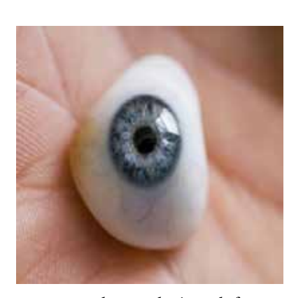
Figure 5. Ocular prosthesis made from acrylic

After the wound has healed, approximately six to eight weeks after surgery, an ocular