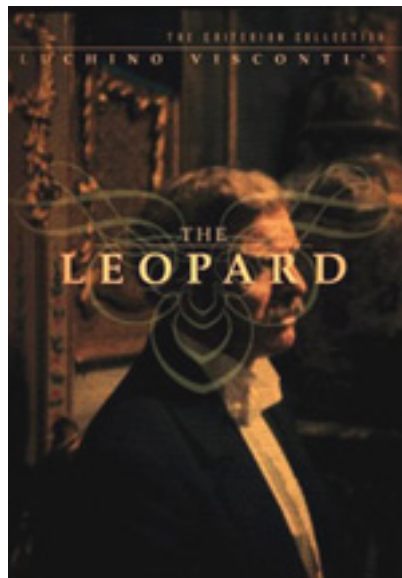
Figure 1: THE LEOPARD DVD ◀ Dir. Luchino Visconti, Italy 1963 ◀ 3-disc set, NTSC, Reg. 1 ◀ Criterion Collection, 2004 ◀ USD 49.95. Discounts

In 1963, Luchino Visconti completed his Italian Risorgimento epic The Leopard ( Il gattopardo , 1963) - one of the best Italian films ever made and a classic of world cinema. In it, the director conjures an era of aristocratic elegance and charm, his own world in fact, being swept away by the energetic and unscrupulous upstarts of the rising bourgeoisie - "the jackals and the sheep" - opportunistically surfing the waves of Garibaldi's popular uprising. This successful transformation into film of the spirit of Giuseppe Tomasi Di Lampedusa's outstanding novel was made possible by the participation of several exceptional artists: the scriptwriter Suso Cecchi D'Amico, without whose genius neither The Leopard nor much of the best post-war Italian cinema would exist; the cinematographer Giuseppe Rotunno; the composer Nino Rota; the costume designer Piero Tosi; the resplendent Claudia Cardinale, and, last but not least, the experienced Hollywood star Burt Lancaster whose magnificent presence as the aging Prince of Salina infused the film with an almost palpable atmosphere of nineteenth century Sicily. Although the film's production company, Titanus, was practically bankrupted by Visconti's super-expensive extravaganza, the producer Goffredo Lombardo decided that this risk had to be taken for the sake of an idea he believed in.