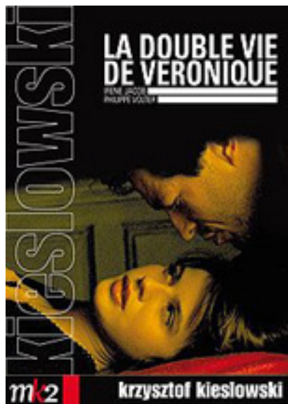
Figure 1: LA DOUBLE VIE DE VERONIQUE DVD (Krzysztof Kieślowski, 1991). PAL, R-2, 2x DVD-9, MK2. 2-disc set Edition Collector. English subtitles. Includes a numbered, matted 6-frame 35mm film strip from a theatrical release print. EUR 24.99.

Double Life of Veronique , one of Kieślowski's most haunting films, is a kind of bridge between the director's "Polish" and "French" perspectives; it also spearheaded the director's international recognition.