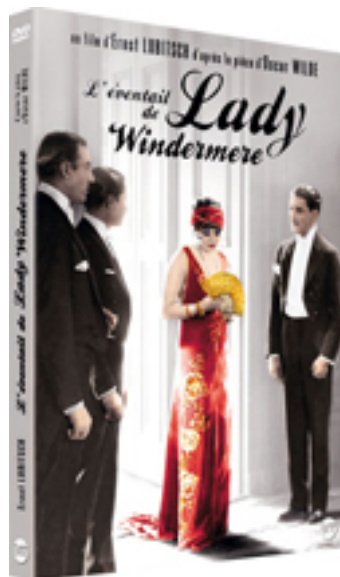
Figure 1: L'ÉVENTAIL DE LADY WINDERMERE DVD. ( Lady Windermere's Fan directed by Ernst Lubitsch, 1925). ¶ Monochrome, silent, with original English intertitles and removable French subtitles.) DVD Collector, éditions Montparnasse. ¶ PAL, Region 2, 79min. Booklet and supplements included. ¶ (EUR 15.00.)

A new alternative has emerged in the form of an excellent restoration of Lubitsch's Fan published in France for a relatively decent price. Language is no problem with this silent movie as the original English intertitles remain intact and the French subtitles may be turned off. The remaining hurdle, the pesky Region-2 encoding remains, however, many film lovers in other geographic areas have probably already found ways out of this predicament.