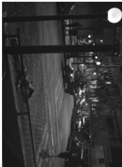
Figure 10: Figure 10: Klaatu's Crucifixion on a Crossbeam

This corona-like energy discharge-cum-hi-tech halo is subtextually analogous to the Gloriele of Christ, that halo/nimbus that adorns the head of the divine, and which is visually depicted in numerous Christ portraits throughout history. This religious interpretation is more easily appreciated when the film's resuscitation bed scene is rotated ninety degrees (see Figure 11). A short time later, accompanied by electronic humming and then urgent beeping sounds that reached a crescendo, the dead Klaatu is "miraculously resurrected" (Shapiro 81) in "a science fiction version of the Ascension" (Saleh 41). Klaatu's alien resuscitation science is therefore directly analogous to the recorded biblical resurrection miracle.