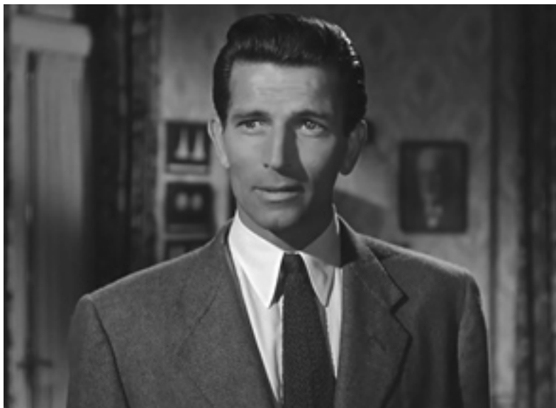
Figure 5: Figure 5: Klaatu as Mr. Carpenter

Not only was this SF film a cautionary political tale about human aggression that had subtextually constructed Klaatu as an alien messiah, but it was also a "modern retelling of the Christ story" (von Gunden and Stock 43) that turned The Day the Earth Stood Still into a subtextual SF Passion picture (i.e., the end time portion of a Christ cycle film). Like Jesus, Klaatu-as-alien-saviour came from the starry heavens, arrived triumphantly, bore wondrous gifts and offered humanity an unprecedented opportunity for galactic redemption. He was about to present an exotic token of friendship, namely a short, spike-pronged object, which some thought looked like a scroll containing a message (Craft 217), when a frightened, trigger-happy soldier ensconced within the defensive military perimeter that encircled Klaatu and his saucer misconstrued Klaatu's peaceful, gift-giving intention and promptly shot him in the shoulder. In that violent xenophobic act, the soldier accidentally destroyed the alien gift being proffered (see Figure 6), and as the wounded Klaatu ruefully explained: "It was a gift for your President. With this he could have studied life on the other planets," but now its colossal powers is "something we have to take purely on faith" (King and Krzywinska 88).