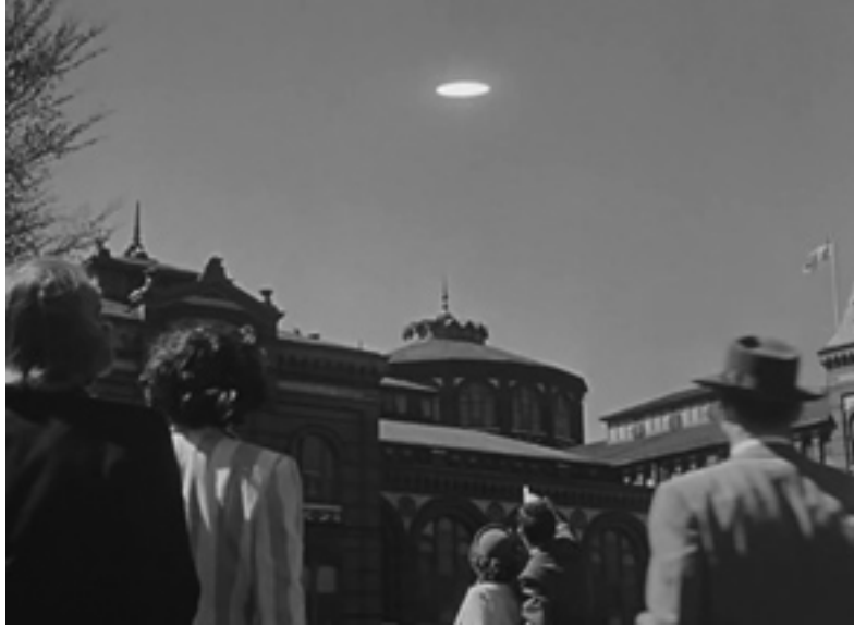
Figure 2: Figure 2: Klaatu's Arriving Star-Ship

sitated Klaatu's pre-emptive act of cosmic intervention on behalf of an advanced collective of alien beings, an "inter-planetary UN" (Stal nbn ), who closely monitored Earth from afar (akin to God and his heavenly helpers overseeing humankind). This inter-planetary confederation had considered it time for Earth to join their interstellar alliance and so their emissary was sent to offer humanity an incredible political opportunity, and a fabulous physical gift as a good-will gesture.