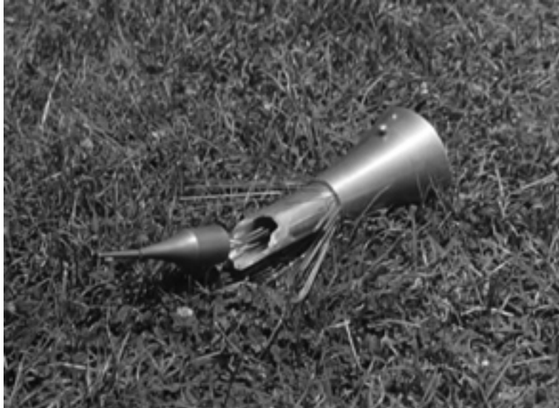
Figure 6: Figure 6: Klaatu's Broken Presidential Gift

must be tracked down like a wild animal. He must be destroyed!" Subtextually speaking, this aggressive newscaster can be seen as the embodiment of the corrupt Jewish Establishment in Jesus's day who vigorously agitated for Christ's death; as attested within Scripture: "the chief priests and elders persuaded the multitude that they should ... destroy Jesus" (Matt. 27:20).