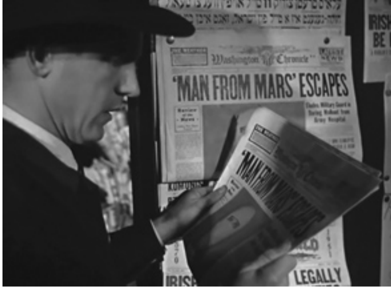
Figure 7: Figure 7: Klaatu, the Martian Menace

cialdom in Jesus's day wherein the terran political, military and religious representatives were content to maintain the status quo and so chose to eliminate the source of their displeasure (i.e., Jesus).