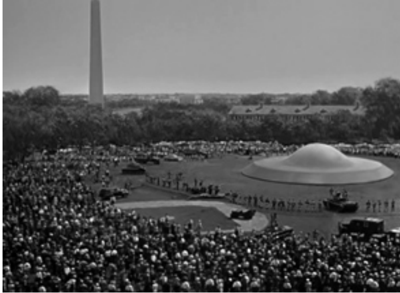
Figure 3: Figure 3: Klaatu's Landed Spaceship in Washington DC

Bobby Benson made "a pilgrimage" (Biskind 152) to the Lincoln Memorial. After reading the Gettysburg Address, Klaatu asked Bobby who was the greatest man in the country and he answered: "The spaceman" (i.e., Klaatu) - out of the proverbial mouth of babes! Furthermore, for Boylston Tompkins, "Klaatu ... is only humanity raised to the tenth power, mysterious, perhaps, gifted with great wisdom, but still killable" (13), but so was Jesus Christ, the human-alien hybrid who was also killable, as attested in Holy Scripture via his crucifixion-death when he "gave up the ghost" (Mark 15:37).