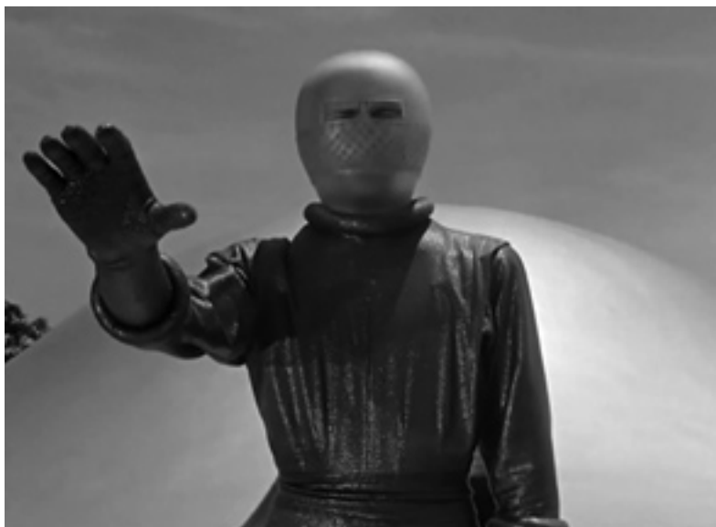
Figure 4: Figure 4: Klaatu's "Peace and Good Will" Benediction

Not only did The Day the Earth Stood Still have a strong altruistic ambience, but as Terence Pettigrew cynically argued: "Calling himself Mr. Carpenter, he [Klaatu] passes of easily as one of us - if anything, he is too genteel and courteous to be one of us" (71; see Figure 5). But once again Klaatu is just like Jesus whose own earthly behaviour was as unorthodox and exceptional in his ancient day as Klaatu's behaviour was in modern-day (1950s) America.