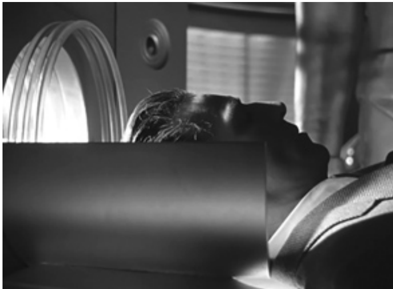
Figure 11: Figure 11: Klaatu's Hi-tech Halo

Before returning home to his heavenly abode, the risen Klaatu "emerges from his ship like Christ from the tomb and delivers a sermon to the assembled scientists" (Gabbard 152), who are to "become his earthly representatives charged with warning the heretical" (Shapiro 81). Unlike many SF films, these male and female scientists from around the world are not depicted as evil, mad or foolish, but rather, as the future hope of humanity precisely because of their rationality, whom Jerome F. Shapiro had referred to as "the scientific wise men and women" (81). Interestingly, this phrase resonated with the encounter of the wise men who visited baby Jesus for a short time (Matt. 2:7-12), and of the adult Jesus who wanted to show up the foolishness of the wise men of his day (1 Cor. 1:19, 27; 3:20). Similarly, as Klaatu effected this when he easily worked out the mathematical problem in celestial mechanics that had stumped Prof. Barnhardt (see Figure 12). The solution was a scientific revelation to the professor which was made even more potent by Klaatu/Carpenter as its intellectual source, savvy problem solver, and practitioner-cum-successful interplanetary traveller.