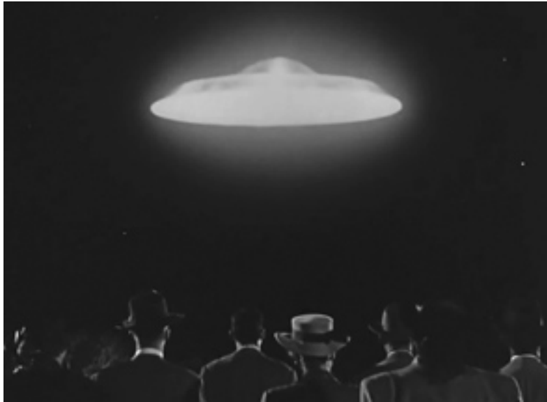
Figure 13: Figure 13: Klaatu's Hi-Tech Ascension

while Phillip L. Gianos called it "an extraordinary mix of science fiction, religion, and political philosophy" (137). One can only agree with them wholeheartedly. Indeed, not only was Klaatu a Christ-figure, but this holy construction was firmly buttressed by interlocking subtextual support characters, including disciples and a betrayer, which will be explicated in the final instalment of this analytical triptych.