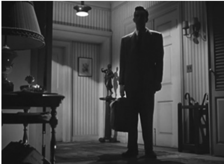
Figure 8: Figure 8: Mr. Carpenter in Shadow

Despite Klaatu's cadre of earthly "disciples" and his (literal) universal message that counselled peace, he was denied, rejected, pursued, cornered and then killed by human ignorance and intolerance (paralleling Jesus's earthly experiences). Klaatu's Christ-figure status was visually confirmed when the military went on their own version of a holy crusade and shot him for being a dangerous prophet-at-large (analogous to the Roman soldiers' pursuit, capture, piercing and crucifixion of Jesus to preserve the military, political and religious status quo of their ancient day). Furthermore, when Klaatu fled the pursuing military during the night and was shot once in the back, he twisted around, grabbed his side, indicating the wound site (akin to Jesus's pierced side - John 19:34), crashed onto the ground, and landed in a classic cruciform pose, complete with splayed arms and appropriately bent knee (see Figure 9).