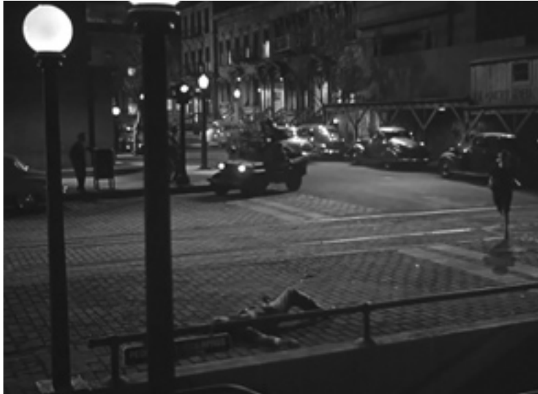
Figure 9: Figure 9: Klaatu's Crucifixion Pose

its "Platonic virtues of clarity, sanity, and reason" (Sobchack 76), a corona-like energy discharge began and "Klaatu's head glows in the rings of the resuscitation machine as though halos shine at his forehead" (Saleh 47).