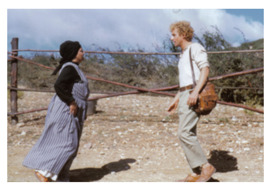
Figure 1: Fiela's Child

According to film historians, 1986/87 can be regarded as the turning point in the South African film industry (Tomaselli 1989; Botha 2012). Only then did several feature films begin to critically examine the South African milieu as well as apartheid and colonial history. One of the films was Fiela se Kind (1987). Fiela se kind was co-produced by Heyns and Edgar Bold, and is based on a popular novel by Dalene Matthee, about the fortunes of Benjamin, a white boy brought up by Fiela Komoetie, a 'coloured' woman of Wolwekraal in the Lange Kloof in the Cape during 1874. The boy, spotted by a census official, is brought before a magistrate's court and claimed by a white woman as the child she had lost some nine years earlier. The heartbroken Fiela tries to retrieve the boy now named Lukas but is blocked by an implacable colonial legal system with strong racist overtones. Lukas is also ill-treated by his new father.