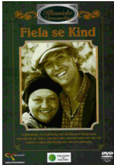
Figure 2: Fiela's Child (promotion poster)