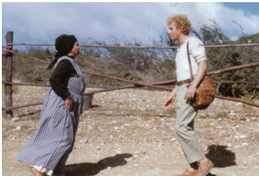
Figure 1: Fiela's Child