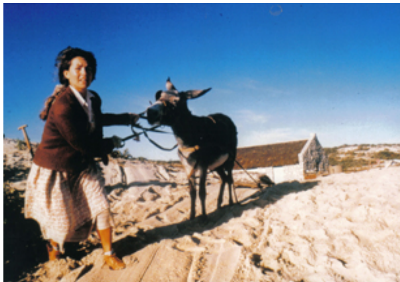
Figure 5: The Story of Klara Viljee