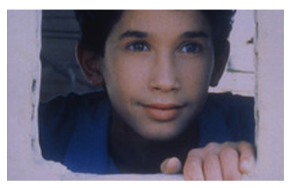
Figure 2: Halfaouine (dir. Ferid Boughedir, 1990)

(This article was originally prepared for a Symposium at the 1992 Carthage Film Festival in Tunis.)