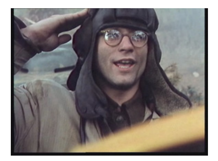
Figure 3: Tank Battalion (dir. Vit Olmer, 1991)