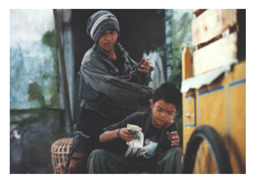
Figure 1: Street children from the Leaf on a Pillow