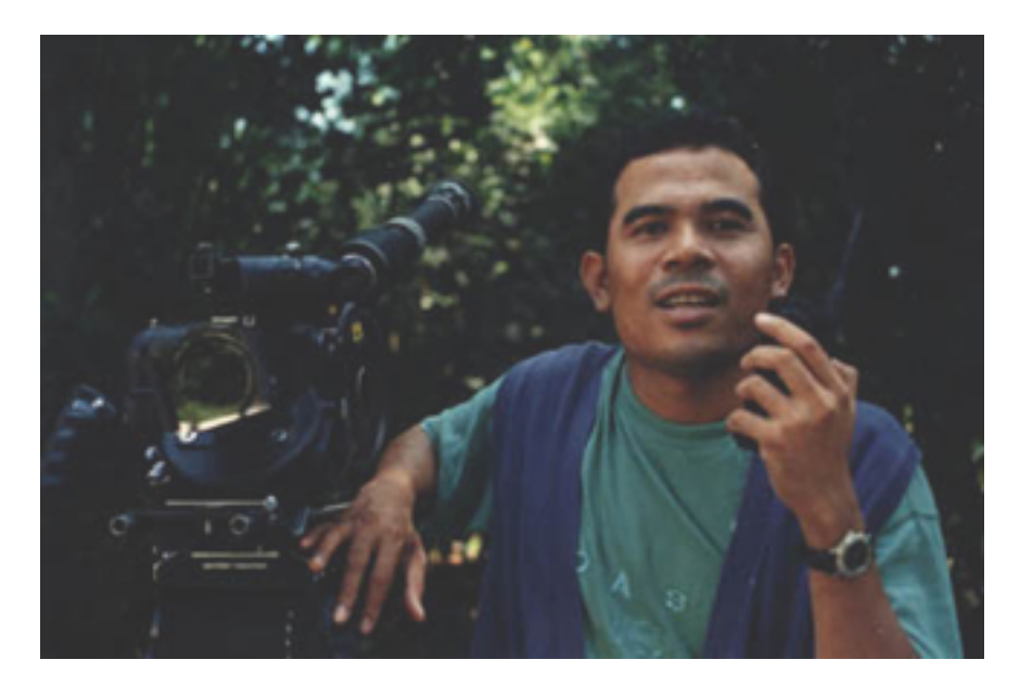
Figure 2: Director Garin Nugroho