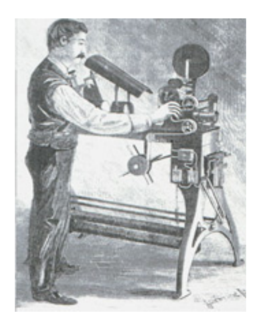
Figure 1: Fig. 1: Thomas Armat's Vitascope