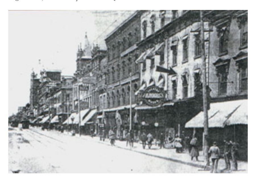
Figure 4: Fig. 4: The arrow indicates 91 Yonge St., c. 1894. The building to the immediate left is No. 93. Both formed Moore's Musee theatre.

One of the prettiest and most realistic scenes in the vitascope exhibition at Robinson's Musee is a reproduction of a serpentine dance, "A La Loie Fuller." The representation of the dance seems as perfect as if the dancer were actually before the audience. The changing lights in the draperies are reproduced in all their vividness [suggesting colour, no doubt] and variety. (33)