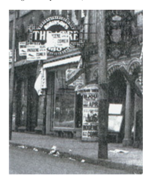
Figure 5: Fig. 5: Robinson's Bijou theatre, formerly Rooobinson's Musee theatre is at the extreme right as it appeared in April 1897.

Loumiere [sic], was opening the cinematograph across the street in an empty store; ...we opened the same day and I think we beat him by a few minutes with our first pictures." (42) Good drama, yes, but not quite accurate, as will be shown in Chapter V. True, the Cinematographe competed with the Vitascope in Toronto, but perhaps not to the point, as Houghton expressed it, that "old timers remember the excitement." (43)