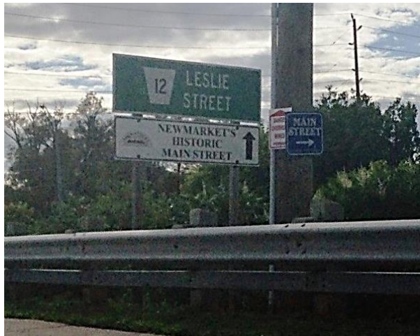
Figure 3 Existing vehicular signage