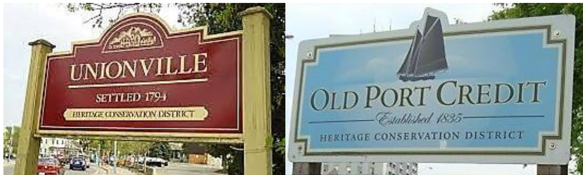
Figure 7 Examples of Heritage Conservation District signage in other GTA communities