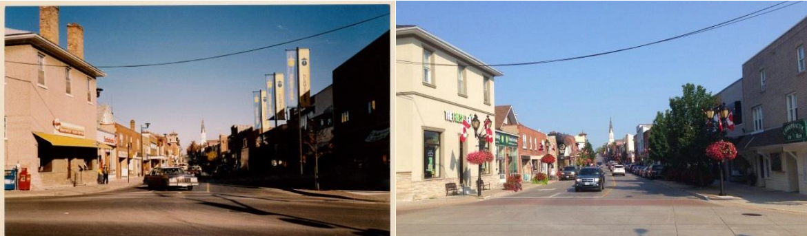
Figure 2 Main Street South in 1985 (left) and in 2015 after streetscape and building improvements (right)