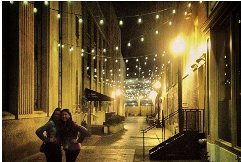
Figure 9: Creative use of illumination