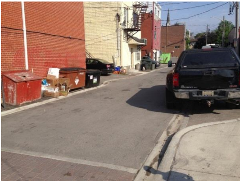
Figure 6 Cedar Street