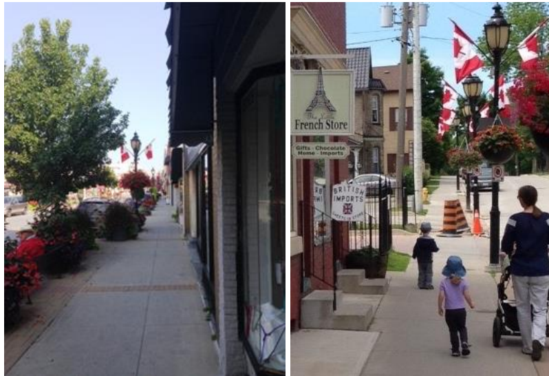
Figure 4: Visual comparison of one dimensional signage (left) to blade signage (right)

to the walkability of a place. Further, there are currently limited seating areas (and where they do exist, seating arrangements are awkward).