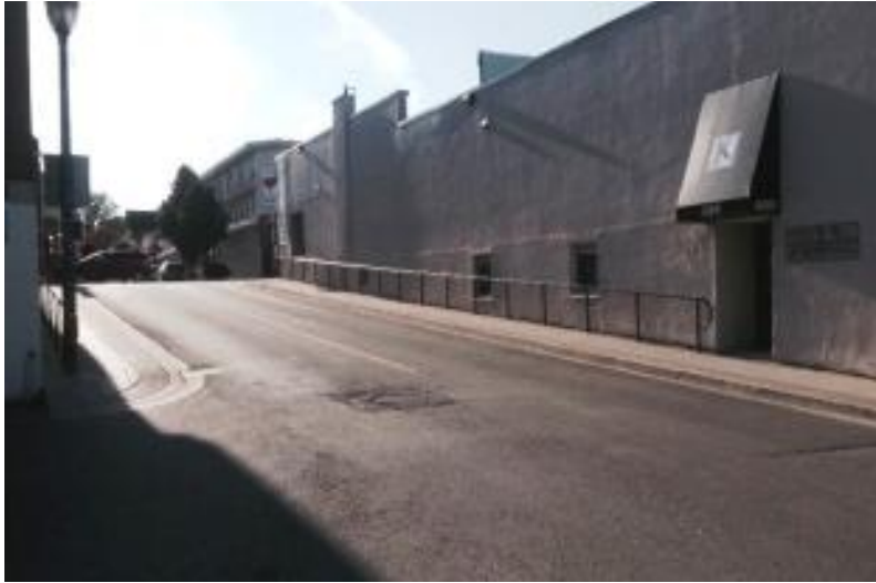
Figure 5 Timothy Street Hill