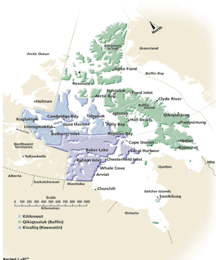
Figure 1. Nunavut regional map