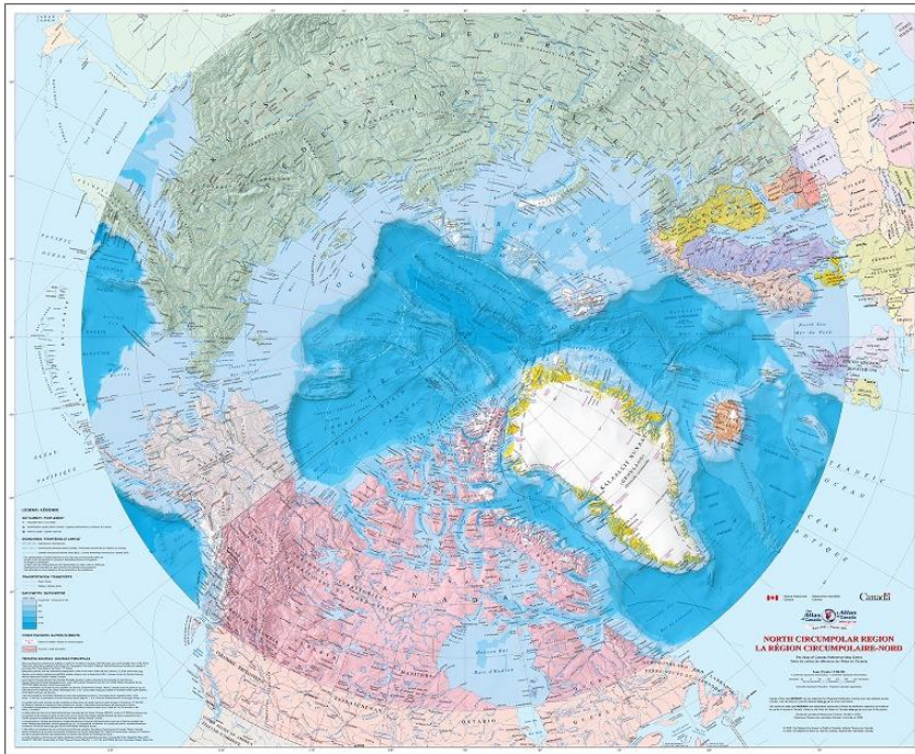
Figure 5. Circumpolar map of the north