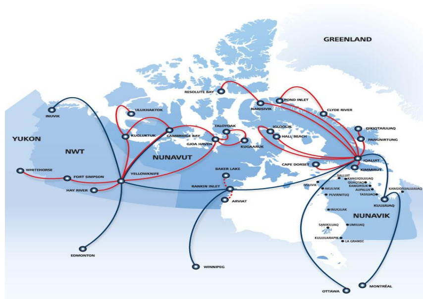
Figure 4. Airline services to Nunavut by First Air