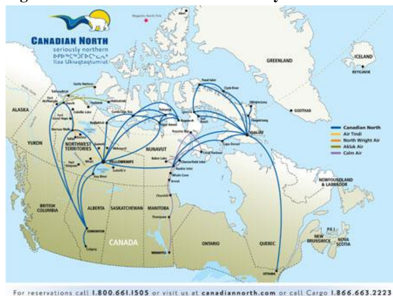
Figure 3. Airline services to Nunavut by Canadian north