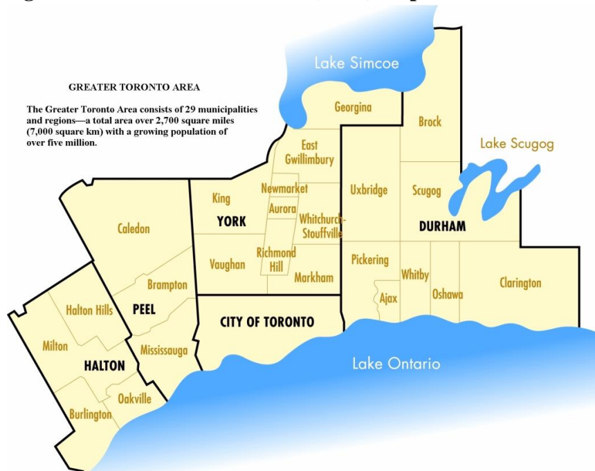
Figure 1: Greater Toronto Area (GTA) map