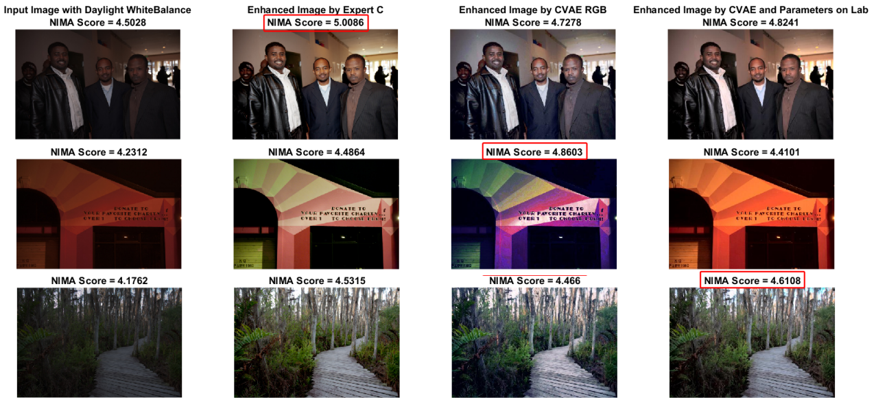
Fig. 2: Quantitative and qualitative illustration of the input and output test images of the MIT-Adobe FiveK dataset [1]. The NIMA score appears on top of each image. The best score of each data is emphasized by a red box.

the Figure 3, selecting the output with maximum NIMA score outperforms the expert’s performance on the test data. In addition to quantitative comparison, we also provide the output of our models for different input images and visually compare the result with the input and expert’s output.